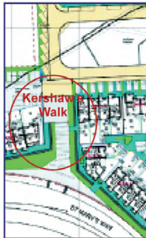
Site of the Pathway